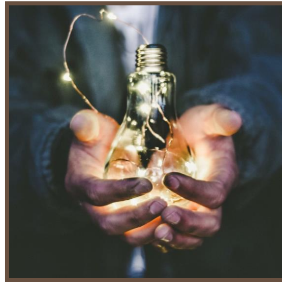
Get them Thinking